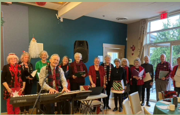
Ho-Ho-Ho Santa Baby!